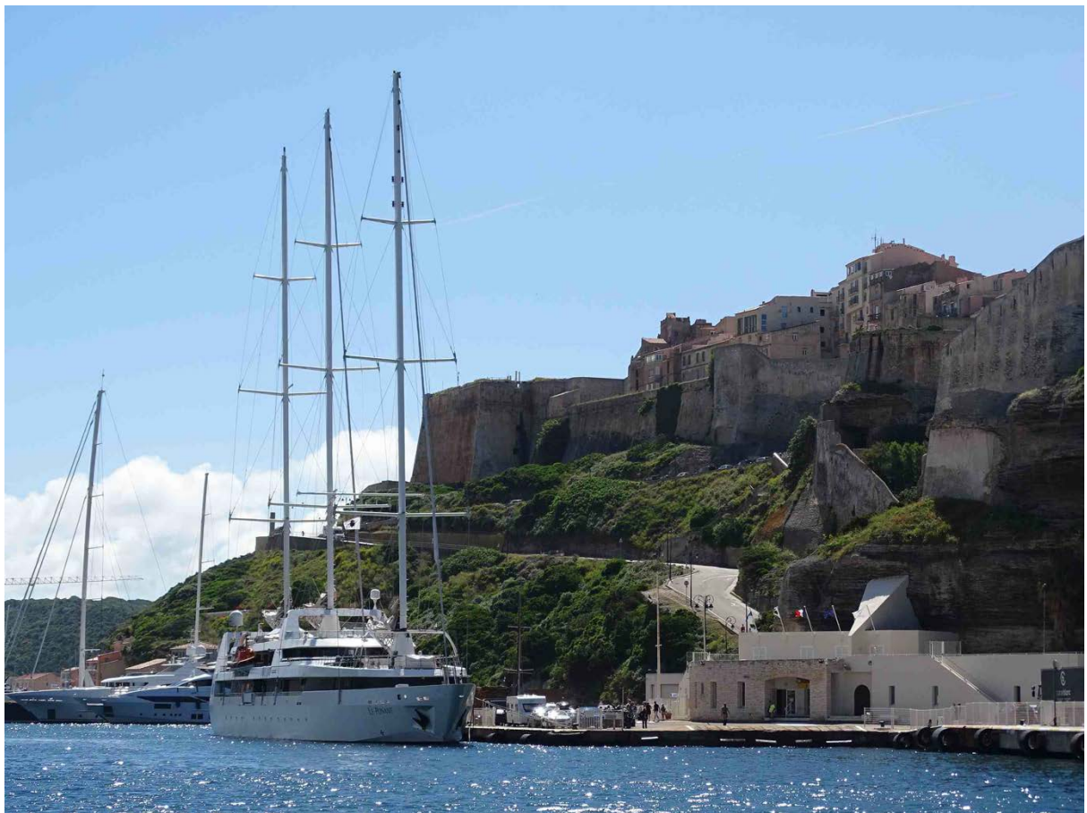
Impressive harbour entry into Bonifacio.