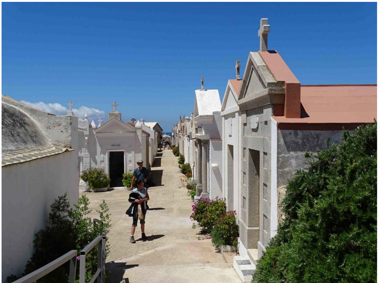
Graves at the edge of the upper town at Bonifacio.