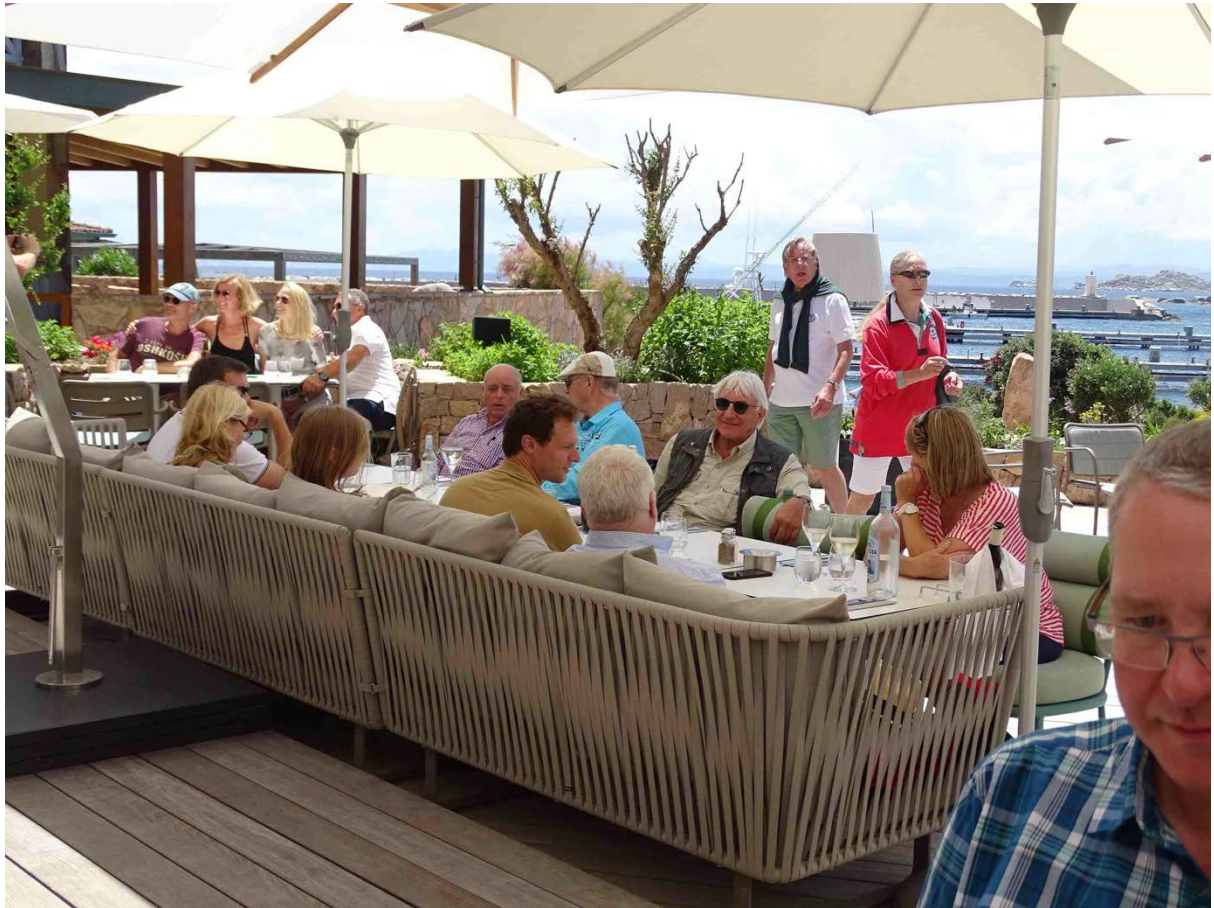
Here, in a dependency of La Ferme – the restaurant on the hill above Cavallo – one is well looked after, so we enjoyed a delicious lunch.