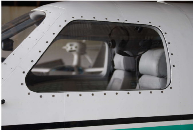
6. OUTSIDE VIEW AFTER INSTALLING THE ICE OR MIST PROTECTING SECOND INSULATION GLASS